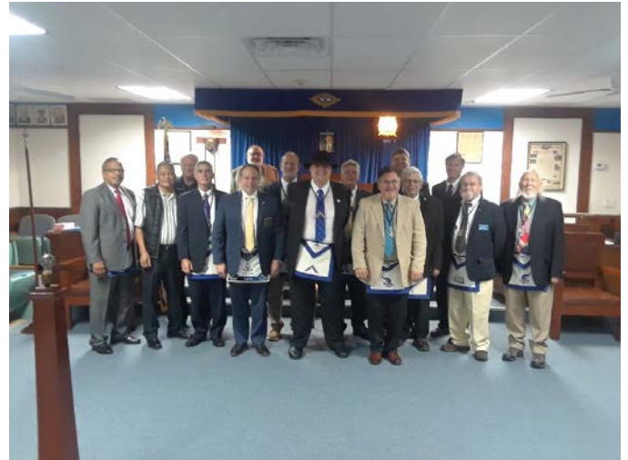
2020 Ribault Lodge Officer Installation