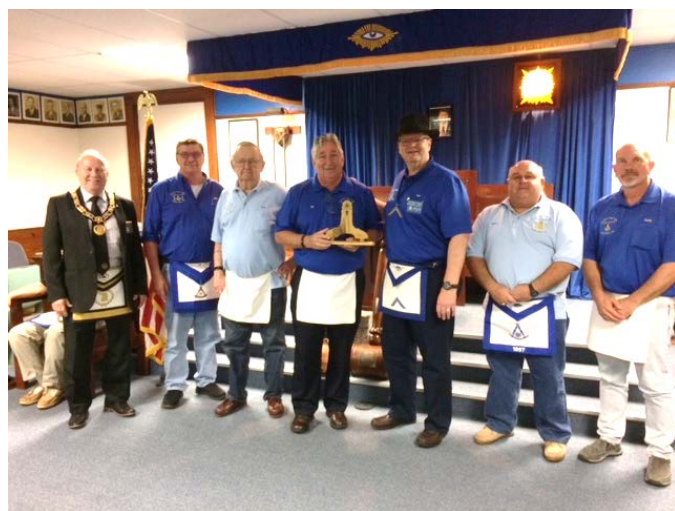
J. Wendell Fargis Brothers visit Ribault to retrieve their Traveling Level