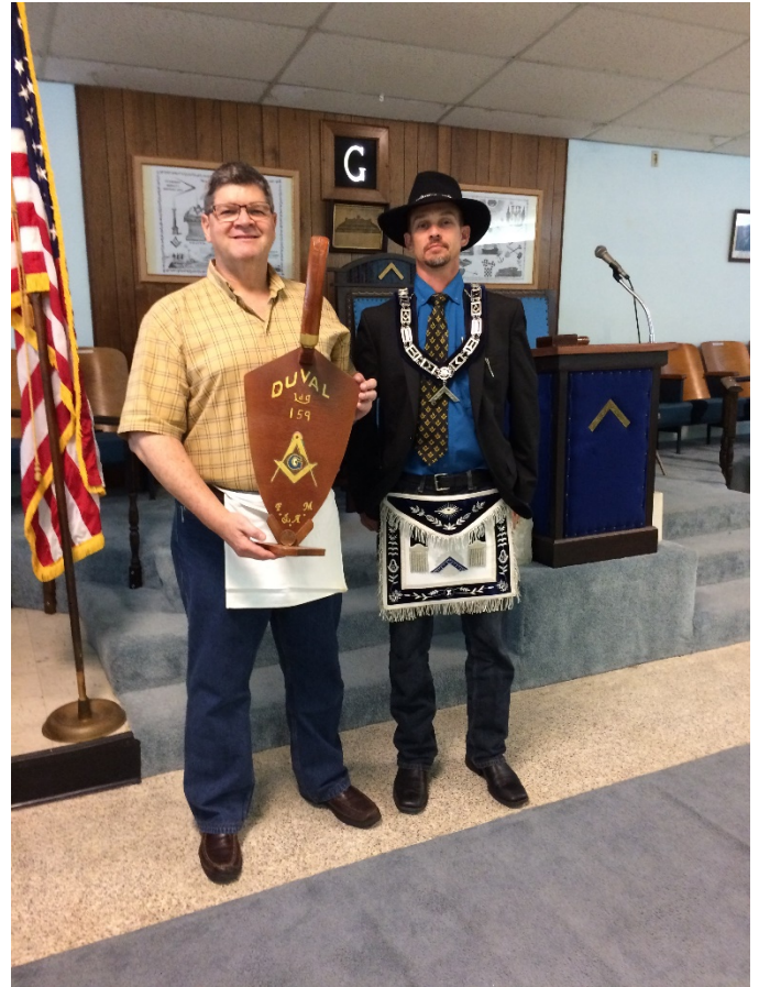
Ribault Lodge visits Duval Lodge and “borrows” their Traveling Trowel