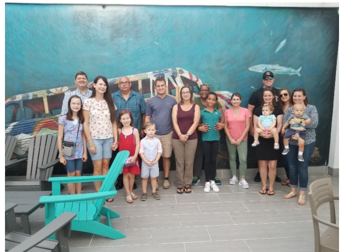
Ribault Lodge treats Mayport Sea Turtle Patrol to supper